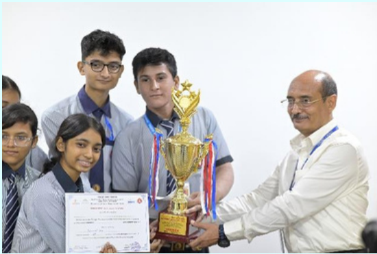
1ST PRIZE IN QUIZ COMPETITION ORGANISED BY NESAC & ISRO