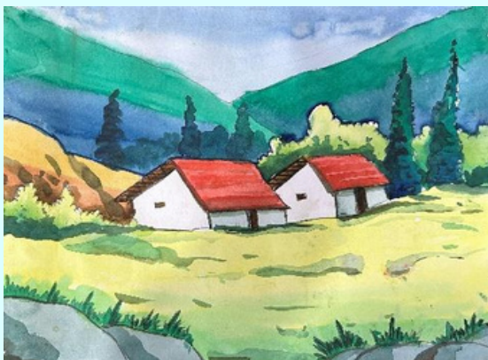
TRISHA DUTTA, CLASS- 9