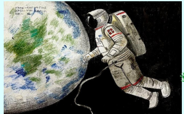
SNEHA DAS, CLASS- 8